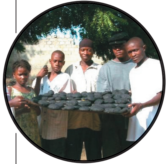
Students of the “Ecole de Charbon”